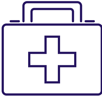
First Aid Kit

RCI Sports Management Solutions will ensure a qualified First Aid Attendant is present during the entire duration of the tournament. The facility will also be equipped with proper first aid response equipment and an emergency contact list for first responders.