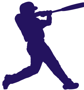
Home Run Derby