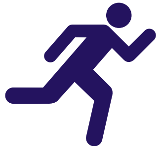
Race the Bases